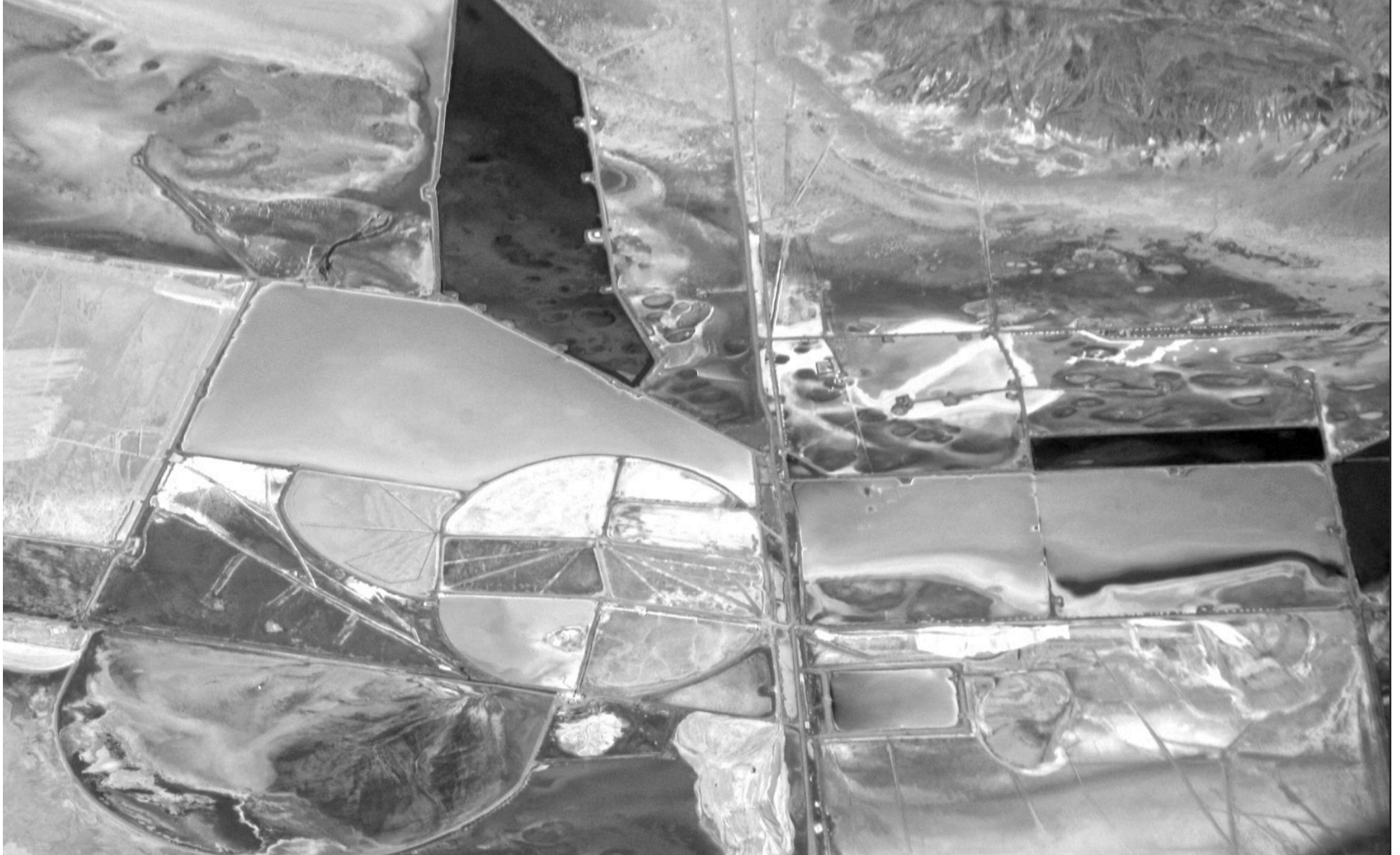
Lithium mining in Nevada